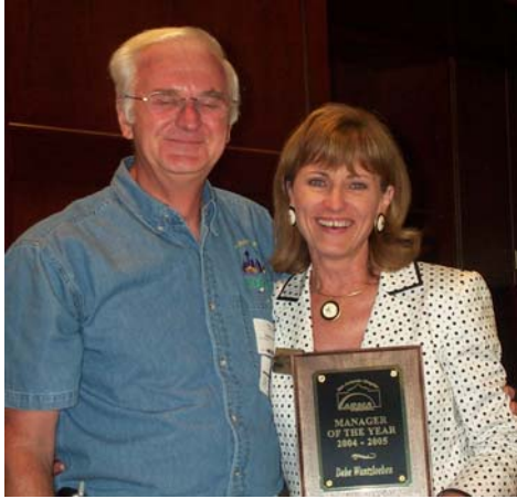
Manager of the Year