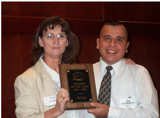
Member of the Year